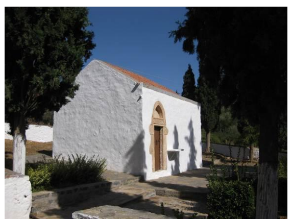
IMG 5125 Archangelos Michail at Exo Lakkonia

Lakkonia. The whole of the interior of the church is painted, mostly with the Archangel and saints, and the lower part of the frescoes is fairly well preserved. There are on the west wall three pictures: two of the founders and one of St Constantine and St Helena. The door of the church, on the south side, has good mouldings and a semi-circular [ogival] arched space above the door. It is clearly of some age.<sup>24</sup>