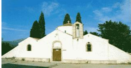
The Panagia Kera, before and after recent whitewashing