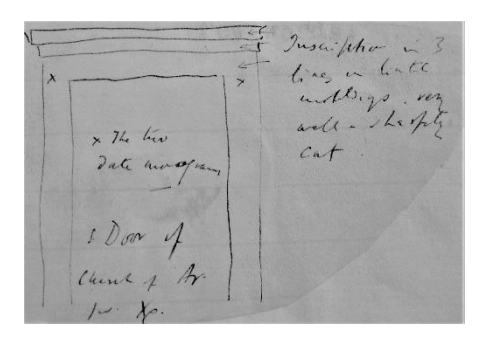
Fig. 1 Inscription in three lines on lintel mouldings, very well and shapely cut.

In the village is the church of St John Chrysostom, dated by an inscription to 1587. It is a quite plain building of the usual type with one vault. On the south door is the inscription on the lintel. The door is nicely made with stone jambs and lintel and plain mouldings. The lintel is cracked and this makes a little difficulty in one place in each of the three lines of letterings, and the whitewash obscures a good many of the accents. The purport of the inscription is that in 1587 the ruined church of the "saint of golden speech" was rebuilt by the best of priests – though not the best of versifiers – Gregorios Phouskis. The position of the inscription on the lintel appears in Fig. 1, and in Fig. 2 I give a facsimile sketch of the first couplet: